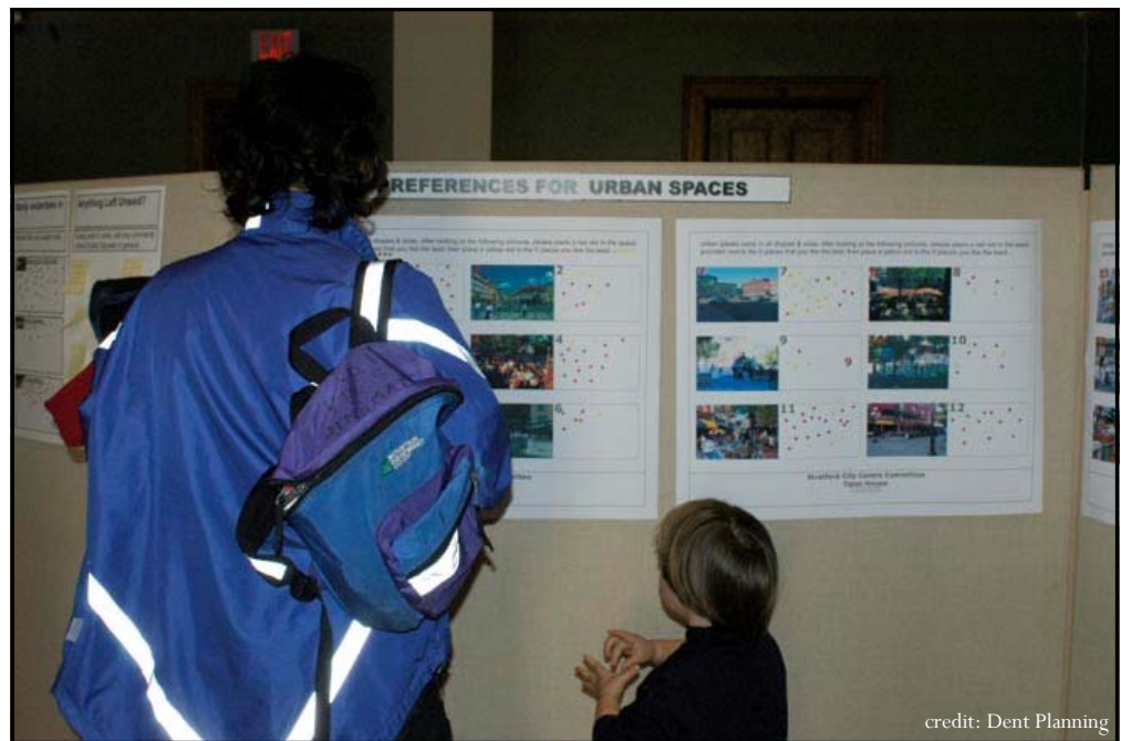
EXAMPLE OF INTERACTIVE BOARD DISPLAY TO GATHER PUBLIC INPUT— OPEN HOUSE, STRATFORD MARKET SQUARE PROJECT

Rounding out the event will be a display of recent photographs of the mill especially commissioned for this event, as well as sketches done by grade 10 art students of McKinnon Park Secondary School. Hospitality will be provided, and the Board has a specially designed notepad for everyone who takes a few minutes out of their day to provide input.