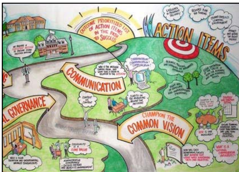
EXAMPLE OF GRAPHIC FACILITATOR’S SKETCH (FOR ANOTHER PROJECT)

They are very interested in the mill project and are excited to be part of this event.